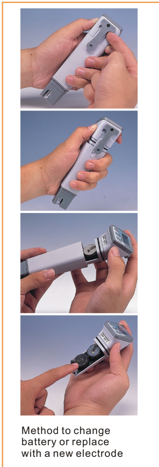
Method to change battery or replace with a new electrode